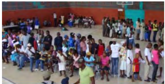
Earthquake refugees receiving VitaMeal and medical assistance in Cap-Haitien