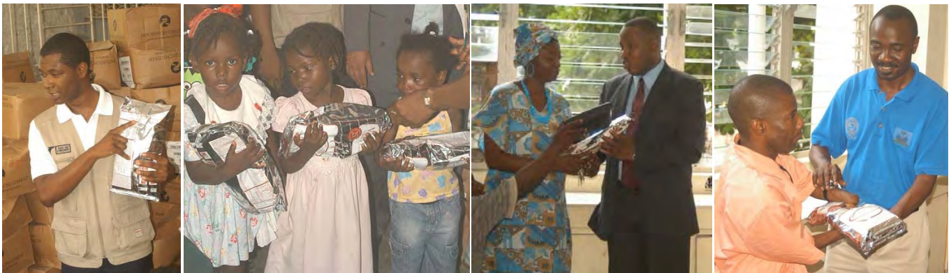
VitaMeal distribution to children affected by HIV/AIDS

FTC's shipments of VitaMeal arrived in the Dominican Republic and were transported to Carrefour by the Pan American Development Foundation. VitaMeal is currently distributed at a camp established by the Catholic Charities and other cooperating agencies, where thousands are living in tents. Nearly 800,000 servings of VitaMeal have arrived or are en route with a commitment to maintain an ongoing supply. Reports reveal there is currently more food in Haiti than there has been for many years, but perhaps none more nutritious than VitaMeal. The challenge and opportunity is for Nourish the Children supporters to continue to donate and distribute food to the people of Haiti as they rebuild their country and as many other organizations and sources of assistance leave. The Nu Skin Force for Good Foundation is rebuilding a school that was decimated by the quake. Our hope is to donate VitaMeal through this school to feed needy students and others in the surrounding community.