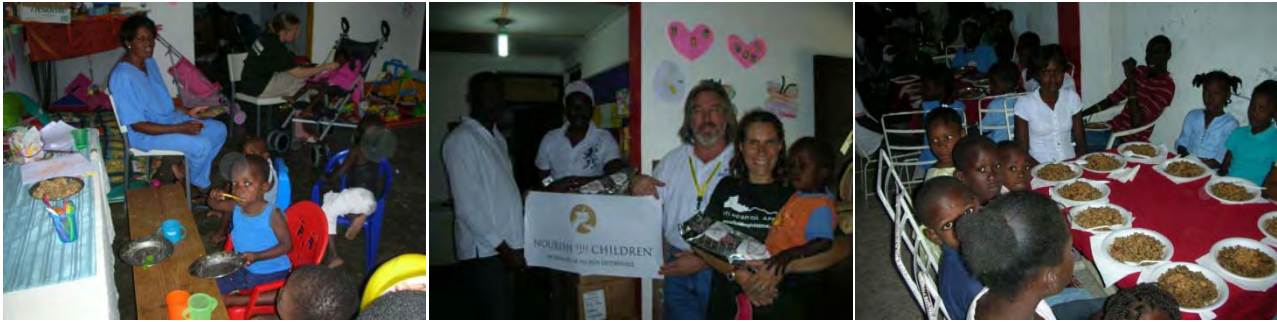
VitaMeal being distributed by Christian Disaster Response

organization that had arranged for air transportation into the area. CDR shipped 2,100 bags by air and 3,900 bags by sea, and focused on helping refugees who fled from the earthquake zone due to aftershocks -- 33 aftershocks ranging from 4.2- to 5.9-magnitude were felt.