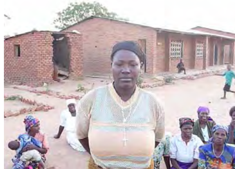
Part of the distribution and one of the beneficiaries thanking FTC for the donation