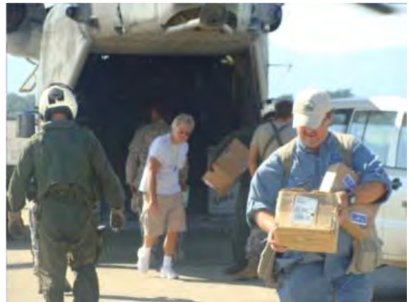
CDR air shipment of VitaMeal

In January and February, our caring distributors in the United States, Europe and China dedicated all, or a portion of their donations, to support the victims of the Haiti earthquake. January donations hit the highest level since the tremendous global distributor response following the Sichuan, China earthquake. Assisting the victims of the Haiti earthquake disaster was extremely challenging due to poor telecommunications and the destruction of the transportation infrastructure, including roadways, airports and harbors. Fortunately, our primary charity partner, Feed the Children (FTC), had approximately 5,000 bags of VitaMeal® stored in Haiti in their damaged offices at the time of the earthquake. As soon as FTC was able to extract the stored VitaMeal, they coordinated with the mayor of Carrefour to distribute the food quickly and efficiently. While FTC worked to establish a dependable shipping route into the earthquake area through the Dominican Republic, we jointly turned to Christian Disaster Response (CDR), the